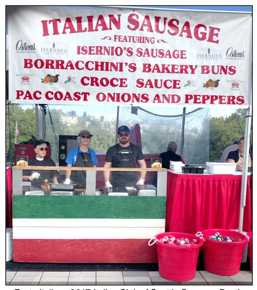
Festa Italiana 2017 Italian Club of Seattle Sausage Booth