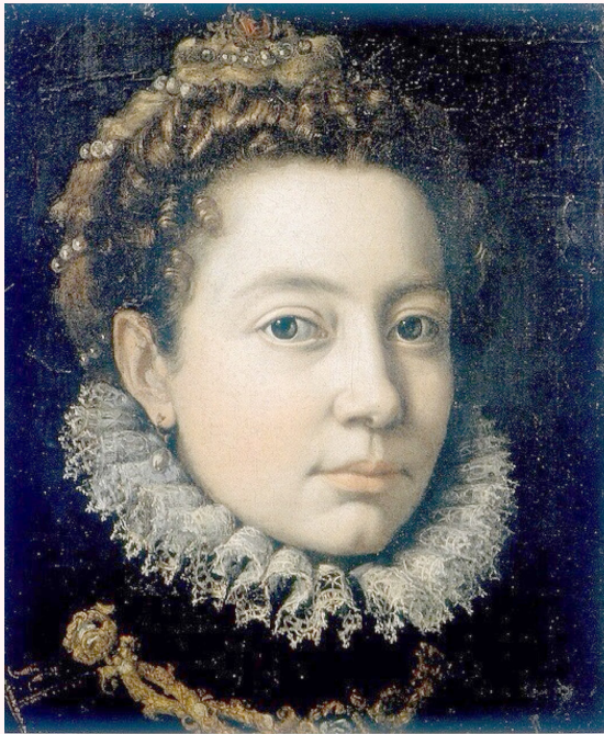
Sofonisba Anguissola, self portrait

She was a great painter of portraits. In a period where the average life span was about 48 years, she lived to the age of 93 - from 1532 to 1625. She was reported to be in good mental health and inquisitive to her final day.