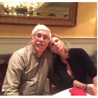
(Additional pictures on page 7)