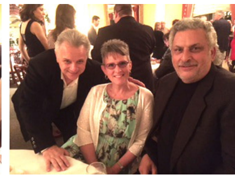
(Additional pictures on page 5)