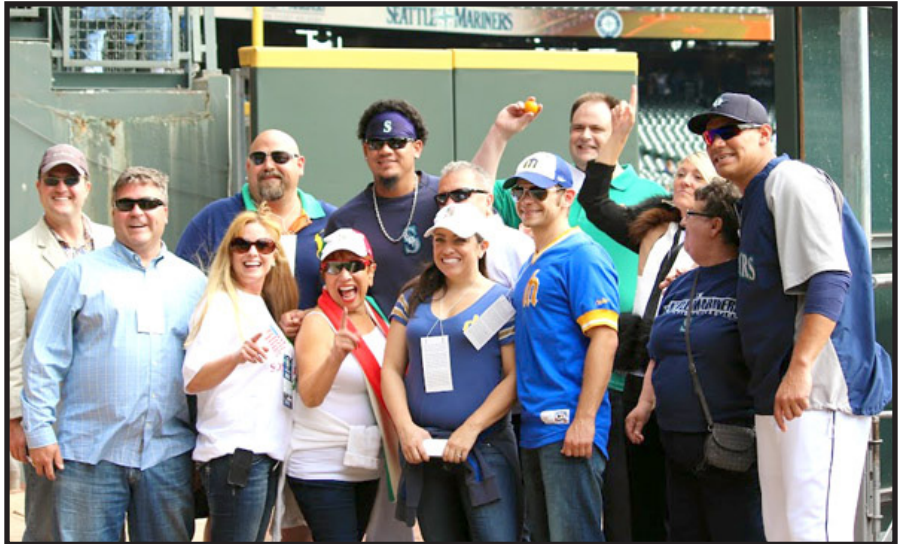
Mariners Italian Heritage Night 2014