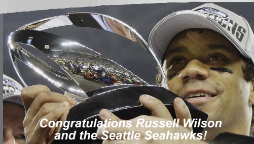
Congratulations Russell Wilson and the Seattle Seahawks!

OFFICIAL BULLETIN OF THE ITALIAN CLUB ESTABLISHED APRIL 26TH 1920