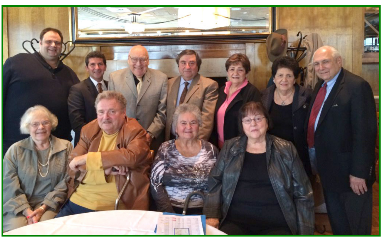
Past President's Luncheon November 13, 2013 at Il Fornaio Restaurant