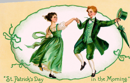
"St. Patrick's Day