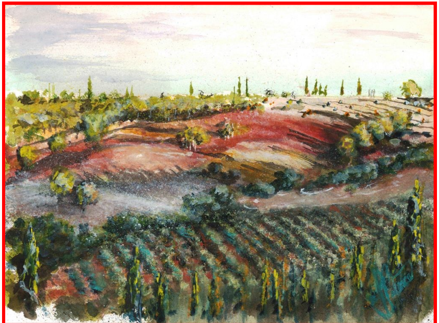
First Morning of the Harvest By Joel Patience