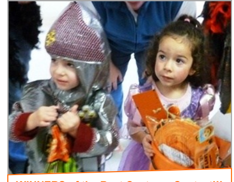
WINNERS of the Best Costume Contest!!!