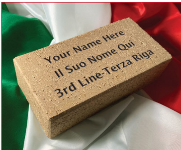
Your brick message may be in English or Italian.