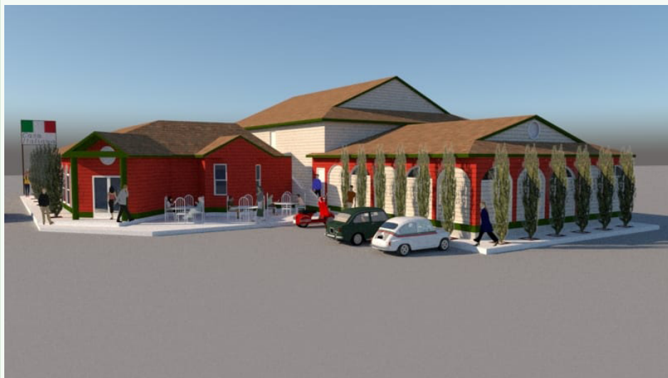
(* Architect's rendering)