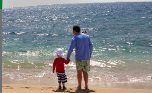
Felice Giorno del Padre

DUE TO COVID-19 VIRUS CONCERNS, THERE IS NO GENERAL OR BOARD MEETING IN JUNE.